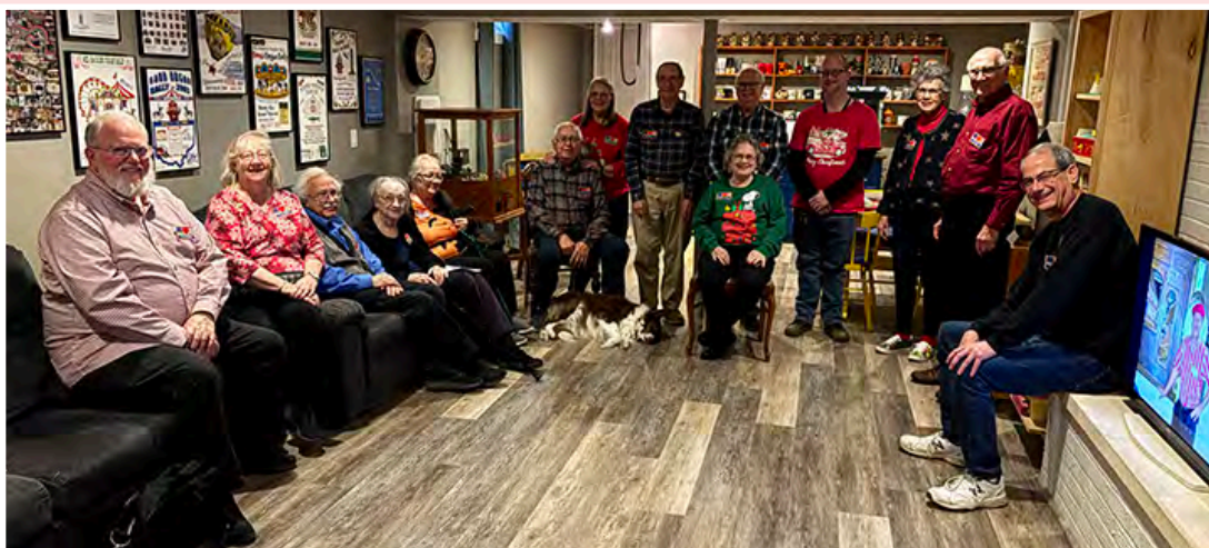
AMICA Christmas Party Attendees