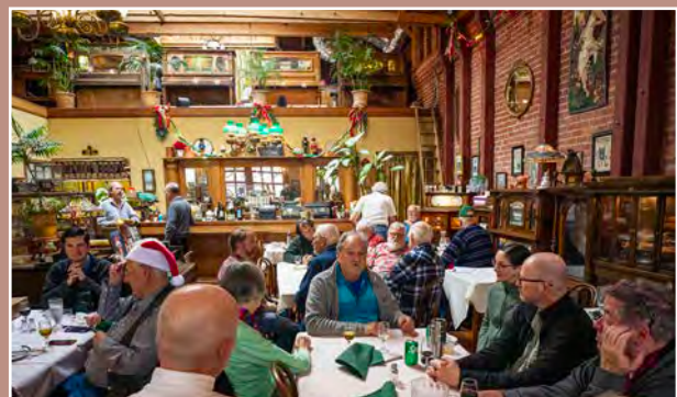
Great view of the restaurant