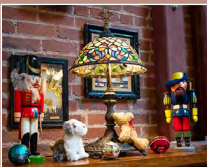
One of many holiday vignettes decorating the tops of the instruments