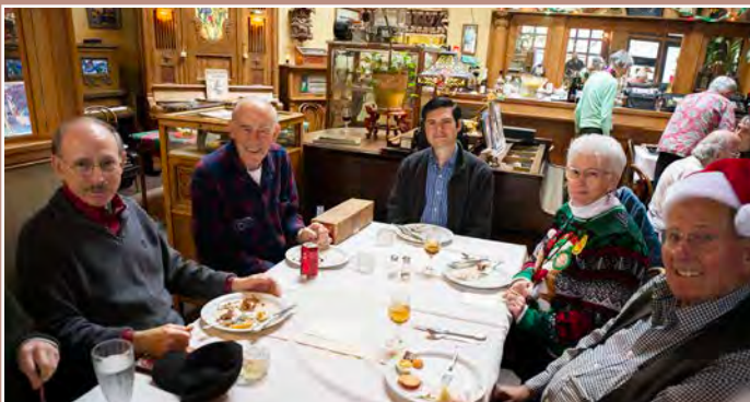
A festive group with the Imhof & Mukle Commandant orchestrion and bar in the background