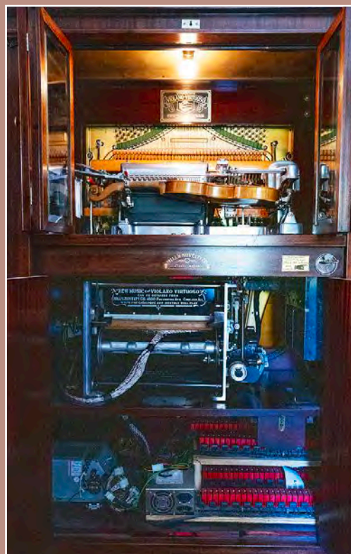
Interior of John's Violano Virtuoso with midi interface at lower right