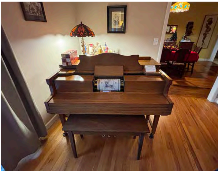
1917 Aeolian DUO-ART reproducing piano