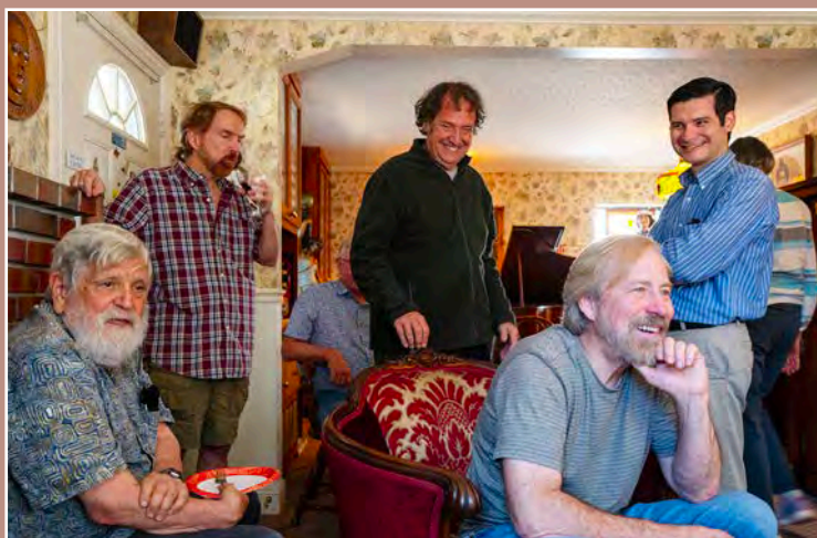
Some of the usual suspects enjoying the moment