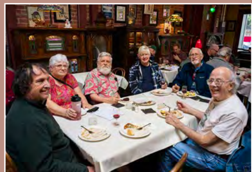
The usual gang enjoying the afternoon